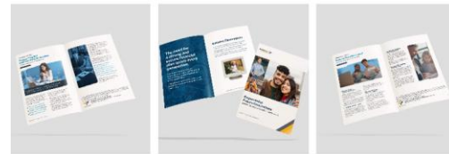
Leaflet: Supporting the Independent Generation Brochure: Empowering Future Generations Leaflet: Future-Proofing Gen Z